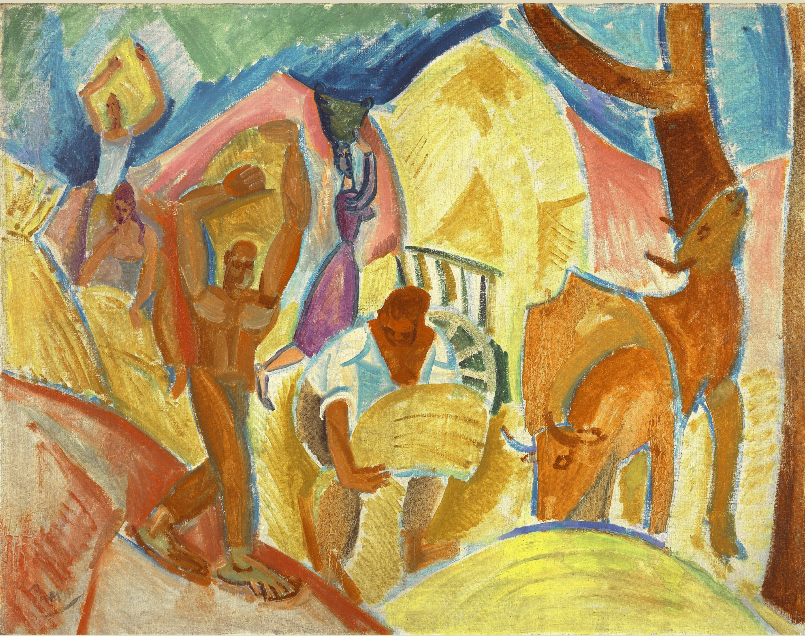
Pablo Picasso, The Harvesters (Les Moissonneurs) , 1907. Oil on canvas, 65 x 81.5 cm. Carmen Thyssen Collection

DECENTRALIZED HISTORIES OF LAND TENURE (16TH – 19TH CENTURIES)